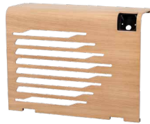
OPTIONAL : WOOD FSC wood from sustainably managed forests Untreated - to be stained.