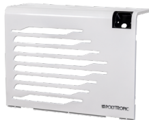
OPTIONAL : CRISTAL High-gloss white metal en option