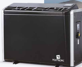
In matt black ABS 70% recycled