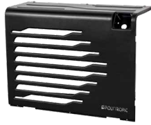
AS STANDARD : DARK ABS 70% recycled matt black

The DARK ABS front panel is fitted as standard, but the optional front panel is supplied assembled: